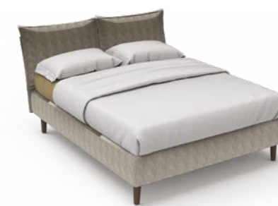
Art. PLUS2 CS

Cotone tinta unita CORA 7 / Solid color cotton CORA 7