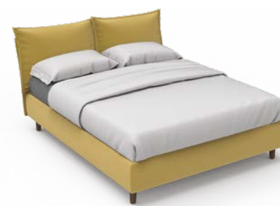
Art. PLUS2 CU

Alcuni esempi di varianti dell'articolo Leo-plus. / Some examples of variations of the article Leo-plus.